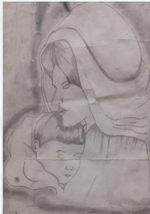
ሙሉዓለም አጋዥ ተረፈ